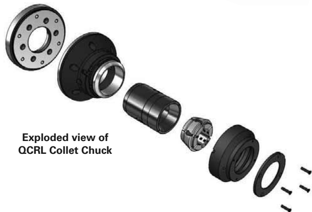
Exploded view of QCRL Collet Chuck